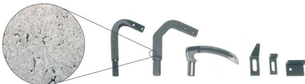
Material AISI 4317 magnified 1:370

Following is the micro structure picture of a casted component made with material AISI 4317 magnified 1:370. This manufacturing method make the parts cheaper because production is only affected by the cost of the mold. As you can see the cross section is not homogeneous and shows blowholes and void which make the component wick and unreliable.