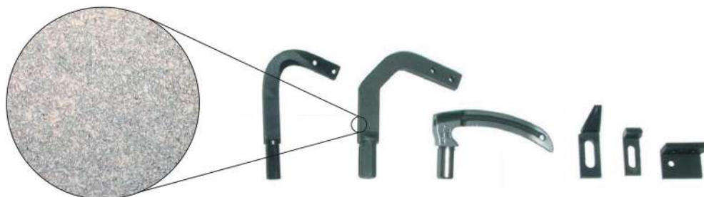
Material AISI 4317 magnified 1:370

Following is the micro structure picture of a drawn bar made with material AISI 4317 magnified 1:370. As you can see, the cross section is very homogeneous and free of porosity. This kind of structure makes the part strong, reliable and long lasting.